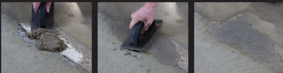
Apply mix to damaged area and smooth with trowel