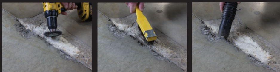
Prepare damaged area