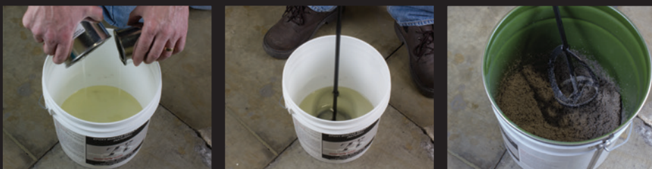
Mix liquid parts A & B then slowly add sand