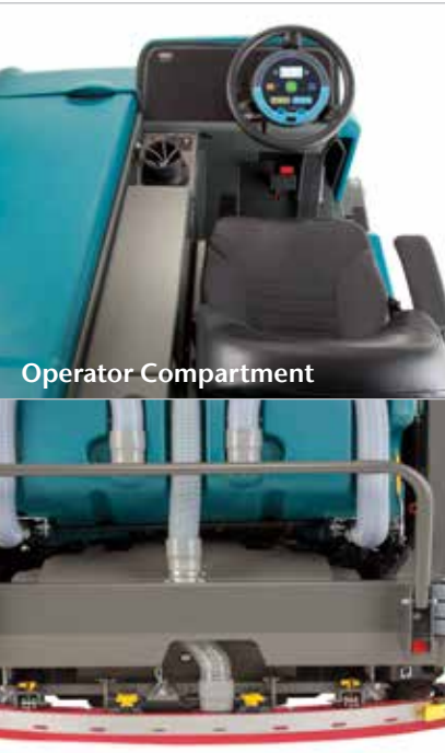
Yellow Maintenance Touch Points

Overhead guard protects operators from falling objects.