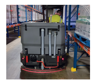
Productive Clean a 9ft aisle in 2 passes (55" with side scrubbing brush)