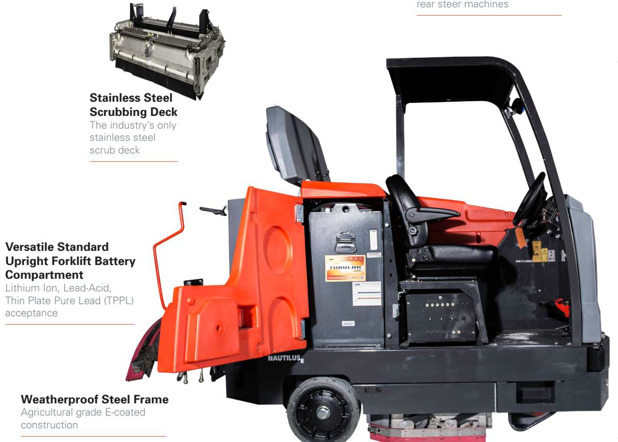
80.00" (height to top of overhead guard)

Less slipping than conventional rear steer machines