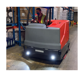
Safe Eyes forward operator design, standard LED front and rear lights