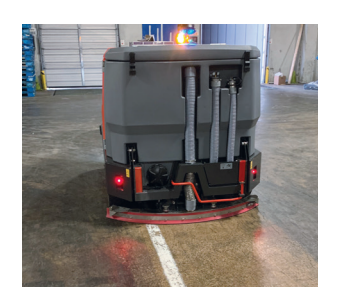
Efficient Single pass scrubbing provides superior results