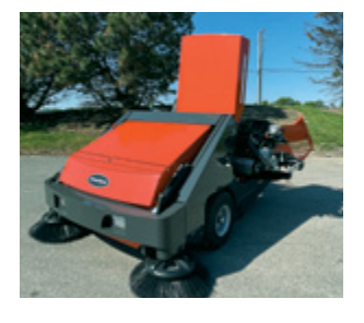
Maintenance Benefits Full engine access for easy serviceability

*Machine photos may show options that are not included on the standard machine