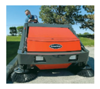
Ergonomics System Open cockpit with unobstructed view

Heavy Duty Filtration Dual "no tools change" synthetic panel filters and aggressive twin shaker motors